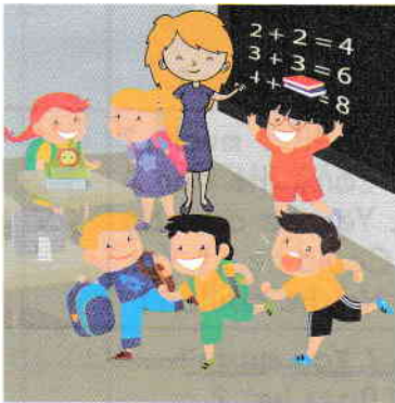
This is our classroom.